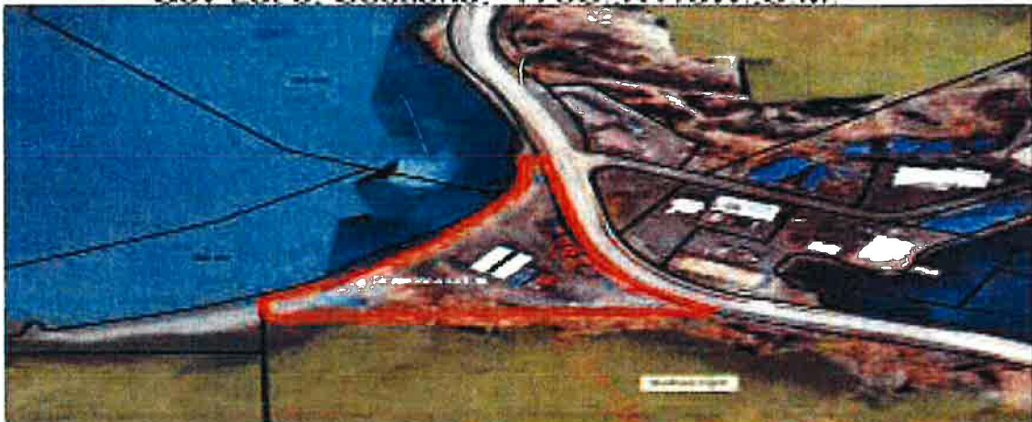
This parcel's legal description is: City of Unalaska, Section 3, T735, R118W, S14.

City of Unalaska, Section 3, T735, R118W, S14