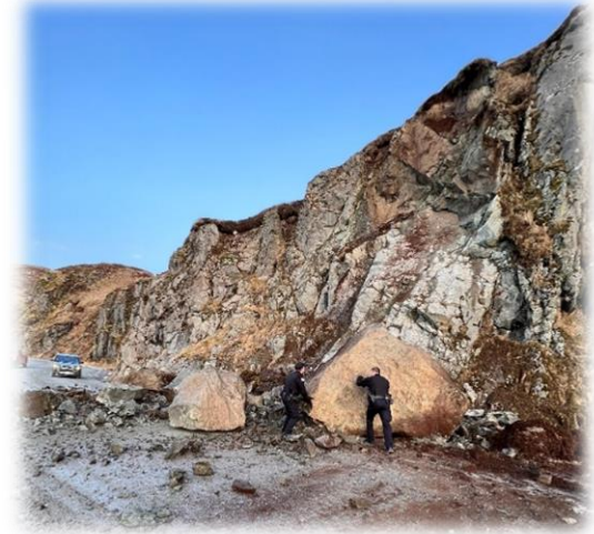
Figure 1: Three boulders totaling 36 tons fell on CBR in March 2023

City of Unalaska 43 Raven Way, P. O. Box 610 Unalaska, AK 99685