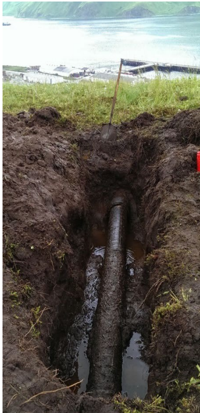
Figure 2: Leaking wood stave pipe connection to NPF

inspections, sediment cleaning, tank repair, and other essential maintenance