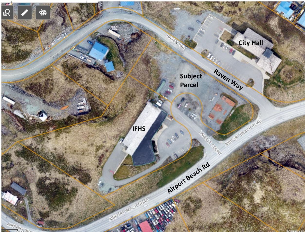
EXHIBIT 1: AERIAL VIEW

CITY MANAGER RECOMMENDATION: None. This is an informational workshop. Also, I have a conflict of interest in this matter as I am President of the IFHS Board of Directors.