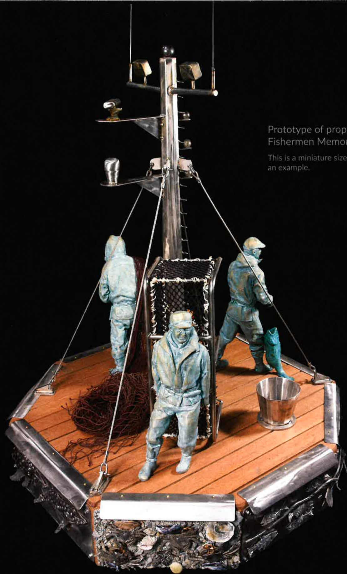
Prototype of proposed Fishermen Memorial

This is a miniature sized model as an example.