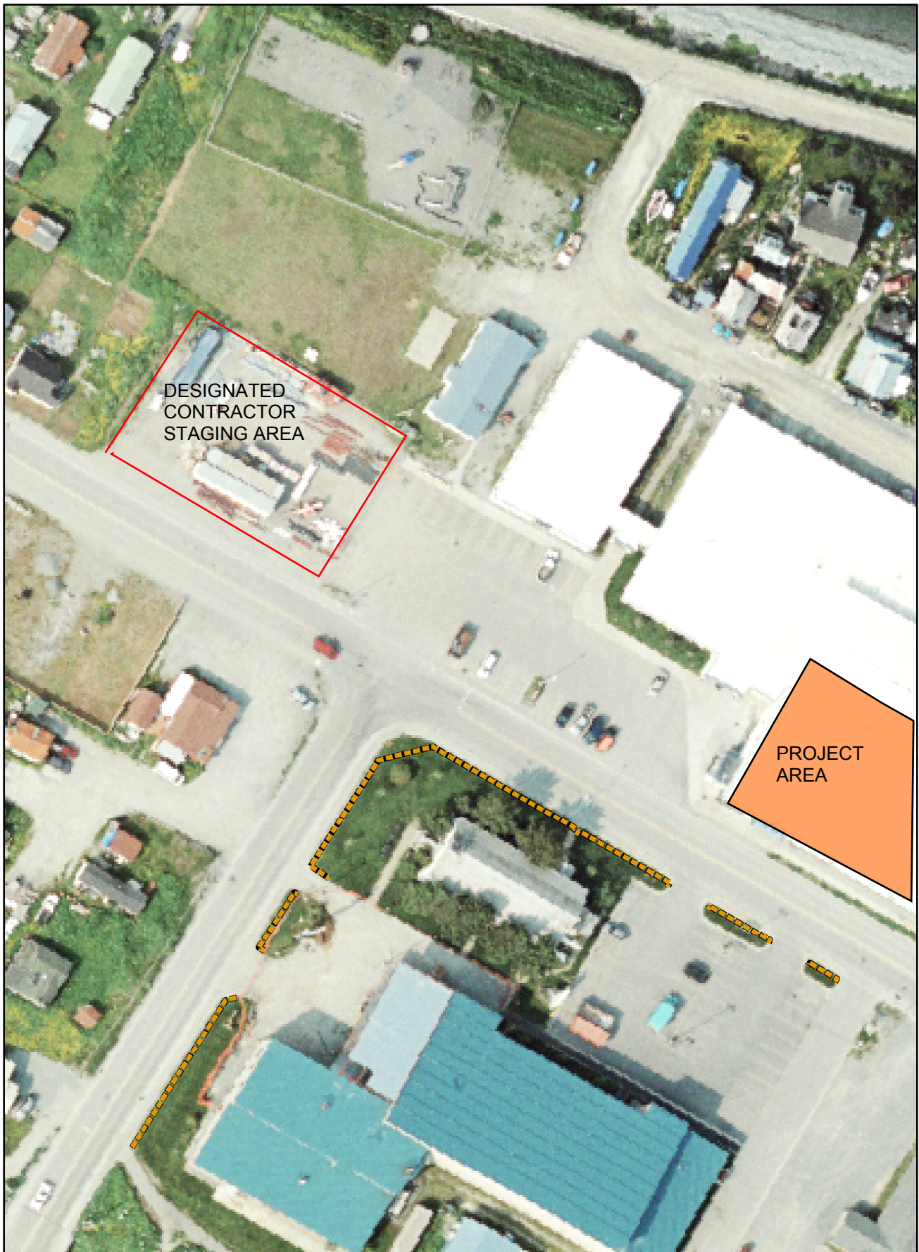
UNALASKA AQUATICS CENTER CONTRACTOR STAGING AREA