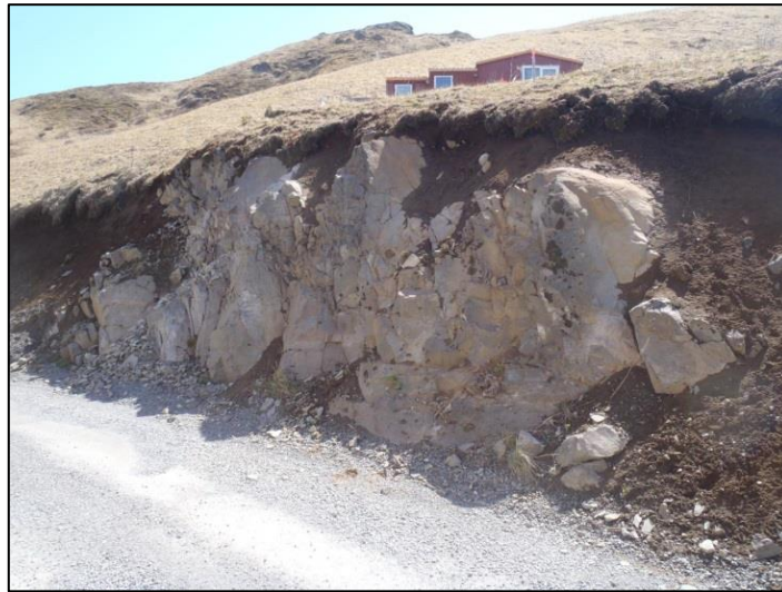
Figure 1: Existing slope with house visible in background.

It is understood that an area on the south side of the Public Safety Building will be excavated to create more useable parking and outdoor storage space. A site visit was made on 5/12/2014 by Robert Pintner, P.E. of R&M Consultants, Inc. to assess the slope conditions and make recommendations for construction. The existing slope is approximately 12 feet tall and consists of generally hard, blocky meta-volcanic bedrock. The rock is overlain by a layer of soil about one to three feet thick, consisting of thinly bedded volcanic ash. This soil layer has eroded and partially obscured portion of the existing rock slope. The final slope height is expected to be a maximum of about 22 feet. A small wood-frame house is located upslope of the proposed cut.