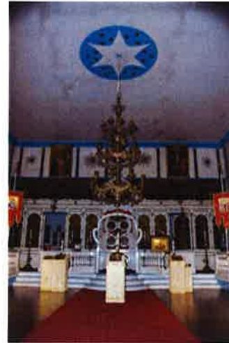
Holy Ascension Cathedral ceiling with sprinkler heads.

Because of these budget reductions, as well as grant funds from Rasmuson Foundation and National Fund for Sacred Places, we did not expend the City of Unalaska funds for fire suppression. At this time, with the installation complete, we request to shift the scope of our grant funding to be utilized for completing the restoration of the historic Bishop's House, which is occurring at the time of this writing and scheduled to conclude in August 2022 (projected budget on the next page).