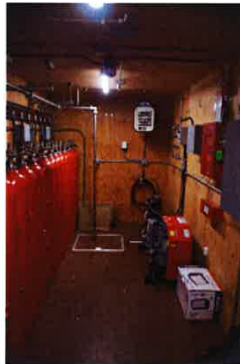
Fire suppression system pressurized canisters in conex.