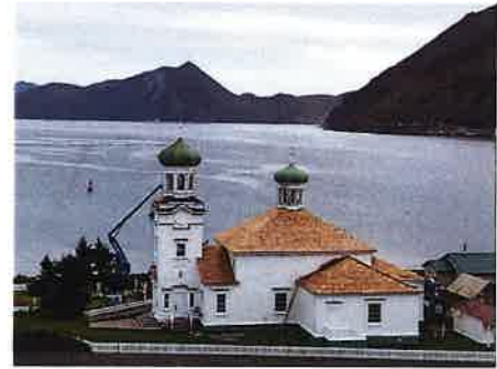
Holy Ascension Cathedral.