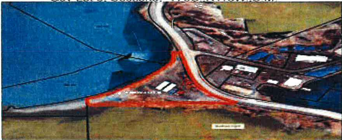
This parcel's legal description is Governmental Lot 9, Section 3, T735, R118W, S4M.