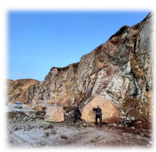
Figure 1: Three boulders totaling 36 tons fell on CBR in March 2023

The CBR Project has three phases: (1) Water line extension, (2) Sewer and Electric line extensions, and (3) Safety Improvements and Paving. Designs for Phase 1 are complete and will be bid out in summer, 2024. Designs are nearly complete for Phase 2. Phase 3 will straighten parts of the roadway, scale back dangerous rock faces, and pave the 3.6 mile road.