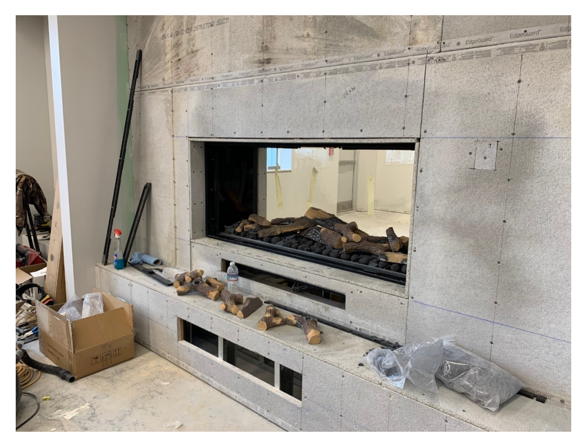
Fireplace Installation. When construction is complete, the fireplace will have a tile surround, with a woodblock collage by artist Ray Hudson.