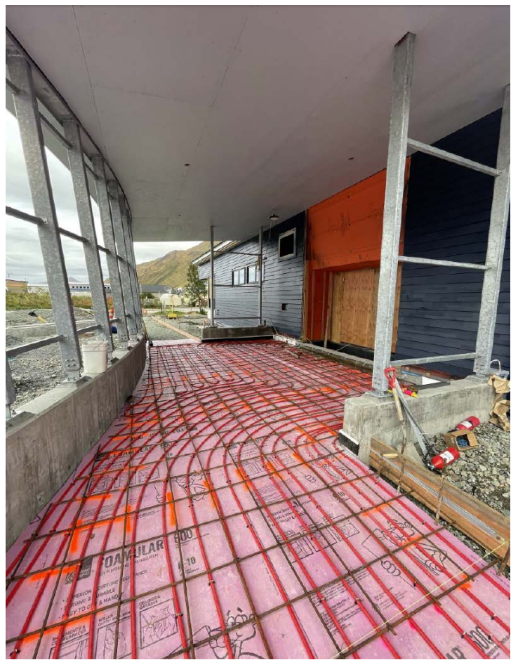
Entryway before final concrete pour, with visible rebar and icemelt system tubing.