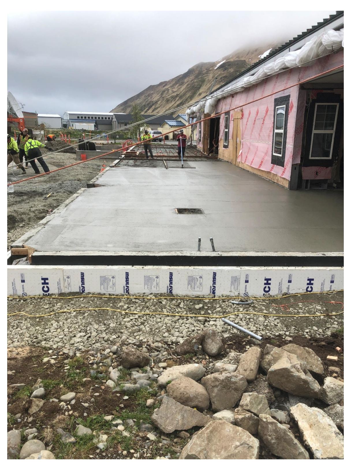
Fresh concrete for the expansion area.