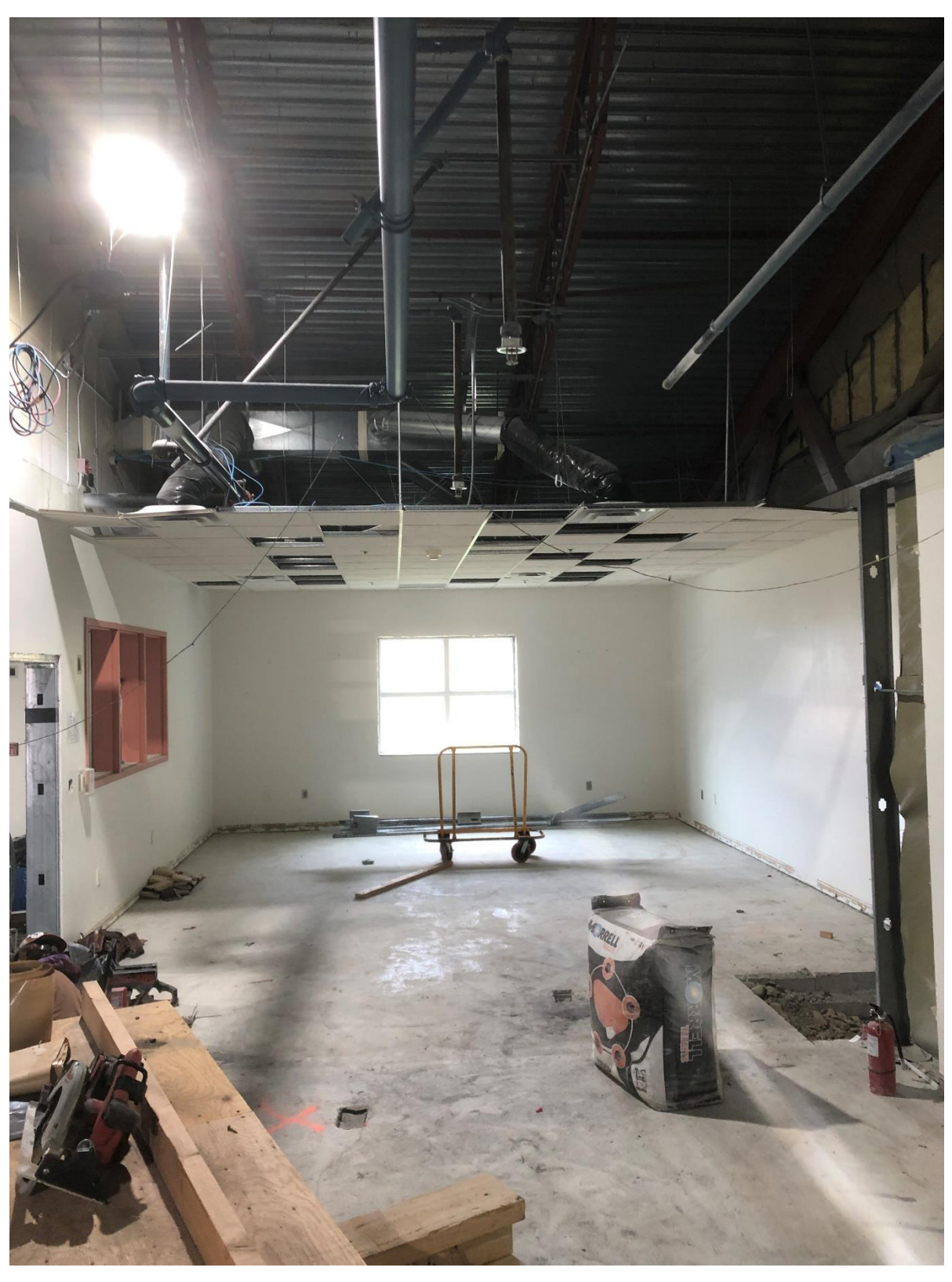
The library's beloved Ray Hudson Room after demolition. The room will be restored to new condition, receiving new paint, carpet, and furniture during the renovation.