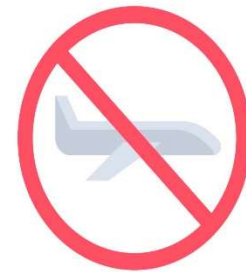
Avoid non essential and international travel