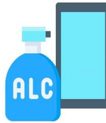
Disinfect high touch surfaces