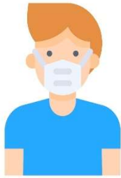
Wear face mask