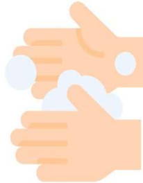
Hand washing frequently