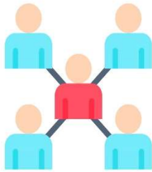
Avoid crowded places